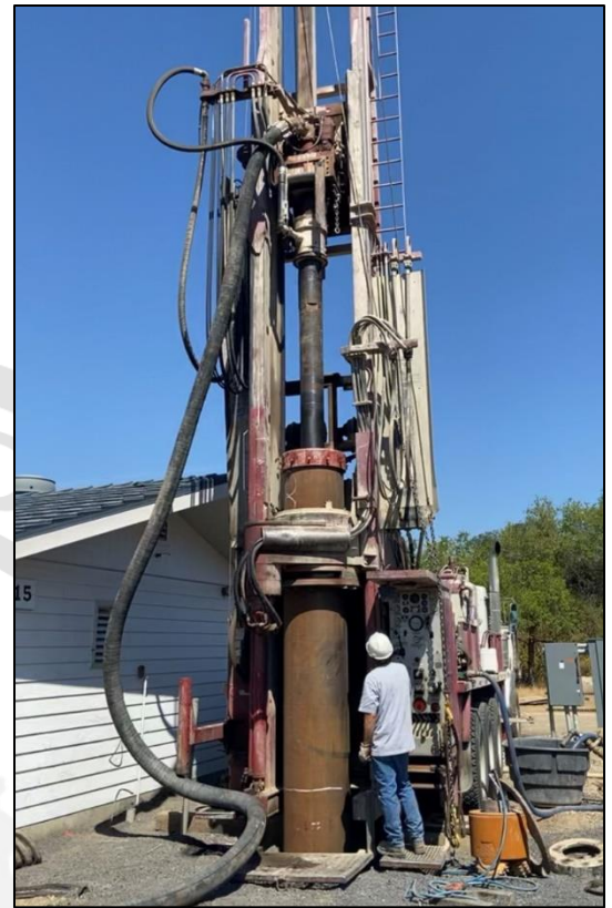
Drilling Rig Installing 24" Casing for Helena Well #2

Results of the study yielded several improvement options to help mitigate water right, hydraulic, source, and storage limitations some of which will be funded by the Water District and some will be funded by developers in the area. One of the improvements was to install another source within the west side of system #4. In late 2021, the District finished drilling and test pumping Helena #2 well near Farwell Road and Hwy 2 with an anticipated yield of 2,700 gallons per minute. In early 2022, the District received approval from Washington State Department of Health to begin installation of the distribution system piping out of the well and construction of the 700 sq foot building expansion. The pump, motor, and electrical components have been placed on order and are expected to be installed summer of 2022 in anticipation of having Helena #2 online and pumping water by 2023.