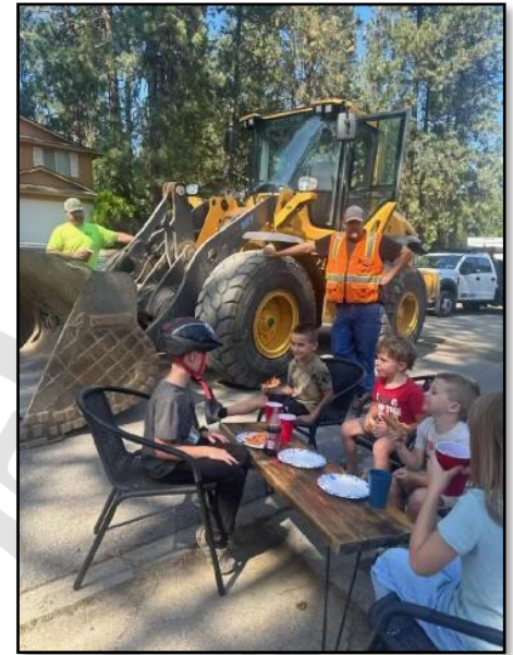
Big Sky Inc. Throwing a Pizza Party and Equipment Tour for Local Kids During the Buttercup & Wardson Project.