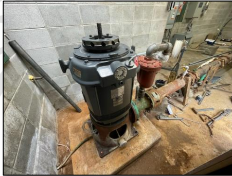
New 50 Horsepower Motor Being Installed

Last year we replaced the pump and motor at our wellsite in Pine River Park. The existing single-phase motor was approaching 25 years old and was upgraded to a new three-phase 50 horsepower motor paired with a 330